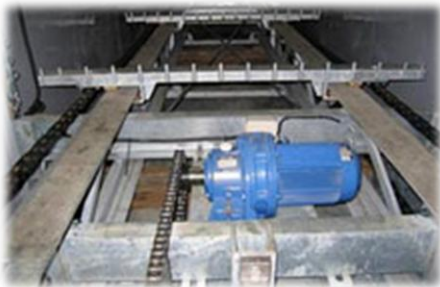
Auto-crawler ice storage Structure-3