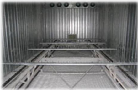
Auto-crawler ice storage Structure-1