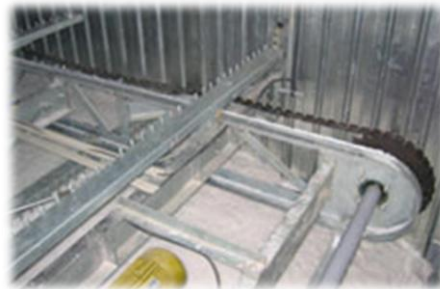
Auto-crawler ice storage Structure-2